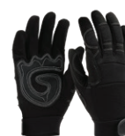
Chlorosulphonated Polyethylene (CSM)